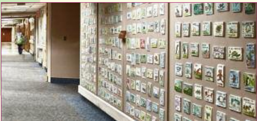
Baby Tiles are hung in the Family Birthing Center corridor.